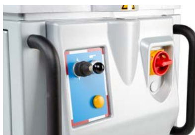
Handy front mounted handles for extra protection, easy movability and effortless positioning.