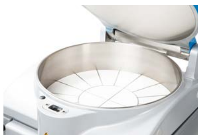
Round (47 x 12 cm) stainless steel dough bowl for up to 20 kg of dough.